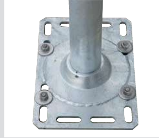
Post with base plate for slatted floor