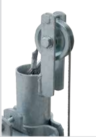
Safe and easy rope-guided system