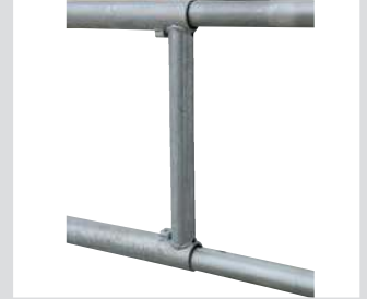
Shorter tubes offer adjustable widths