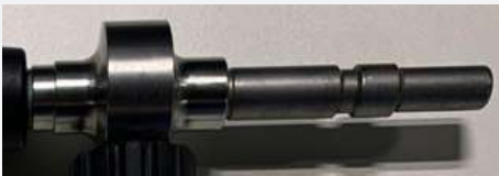
In the image a KEW coupling. This can be tightened using an Allen key.